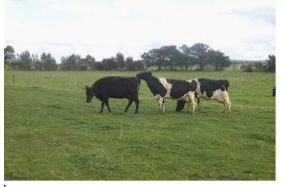
Fig 1: Records of when cows are seen in heat can provide valuable information even if cows are not served

At least 75% - but in problem herds non-return rates can be very high even though pregnancy rates are very low