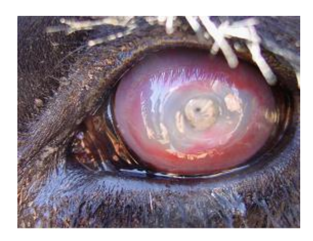
Fig 3: Advanced case of IBK showing deep corneal ulceration

The main differential diagnoses your veterinary practitioner will consider include