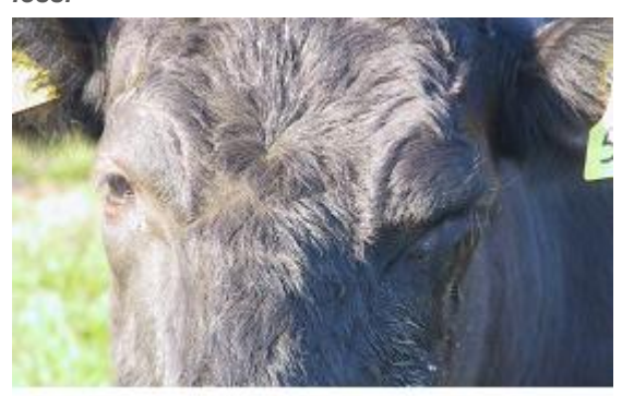
Fig 2: There is marked pain when the eye is exposed to direct sunlight. Note the obvious tear-staining of the face.

Spontaneous recovery may occur in mild cases three to five days after clinical signs are first observed, and is complete two weeks later. In severe cases, ulceration may progress to corneal