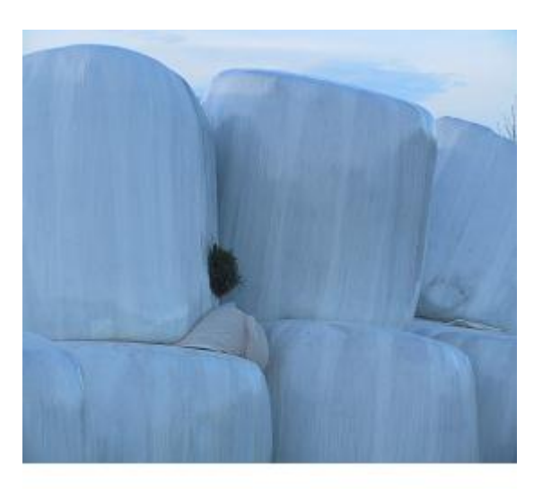
Fig 8: Perforations to the plastic wrap should be repaired immediately.