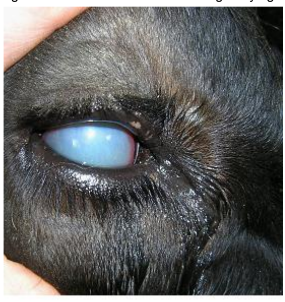
Fig 5: With silage eye there is a bluish-white opacity of the surface of the eye within two to three days.

Bovine iritis, colloquially known as "silage eye" in the UK, is a common cause of uveitis in cattle of all ages fed winter rations of baled silage/haylage.