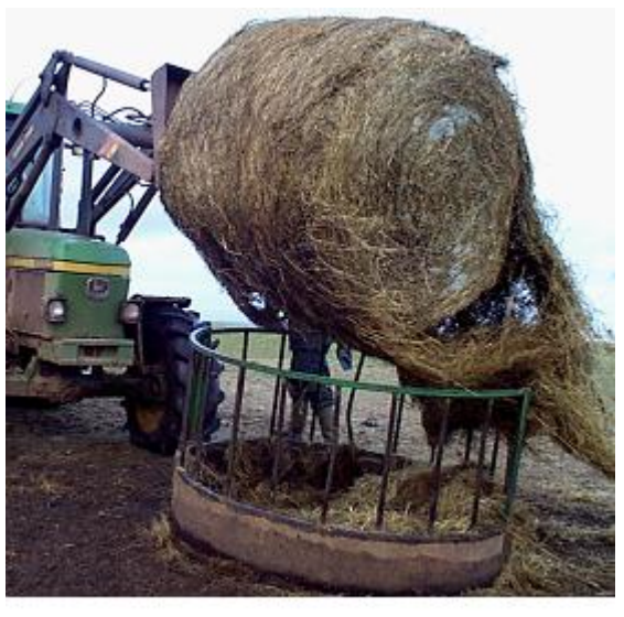
Fig 7: Poor quality silage fed in ring feeders is the major risk factor for silage eye.

Big-bale silage can be rolled out rather than placing in ring feeders to prevent cows burrowing their heads into the bale but this is impractical in most situations. Attention to detail when baling and wrapping silage and ensuring appropriate fermentation conditions should limit contamination with L. monocytogenes the cause of this problem. However, exposure to air for several days before the large bale is eventually eaten provides an ideal environment for L. monocytogenes multiplication.