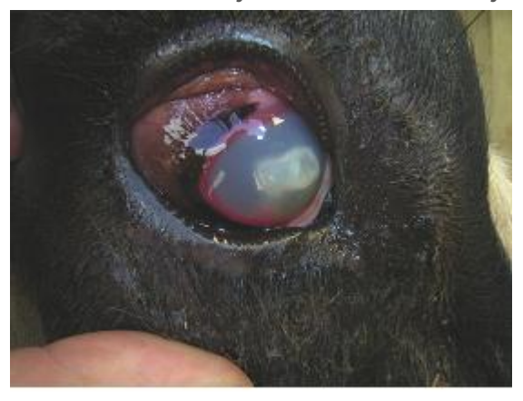
Fig 6: Bulges often appear in the iris with white discolouration