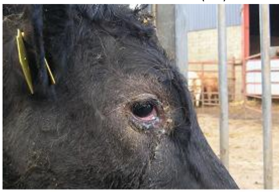
Fig 4: IBR is one of the main differential diagnoses your veterinary practitioner will consider.

Prompt treatment is essential. Topical ophthalmic antibiotic cream containing cloxacillin is commonly used. Antibiotic injection (penicillin, oxytetracycline or ceftiofur) into the dorsal bulbar conjunctiva is the best treatment but can be difficult to achieve in fractious cattle and requires good restraint. Injection into the upper palpebral conjunctiva is commonly used but it should be noted that this technique will not give residual antibiotic levels in the eye and relies on leakage onto the cornea from the injection site. This technique has no advantage over systemic injection except the much lower cost because of the smaller antibiotic dose.